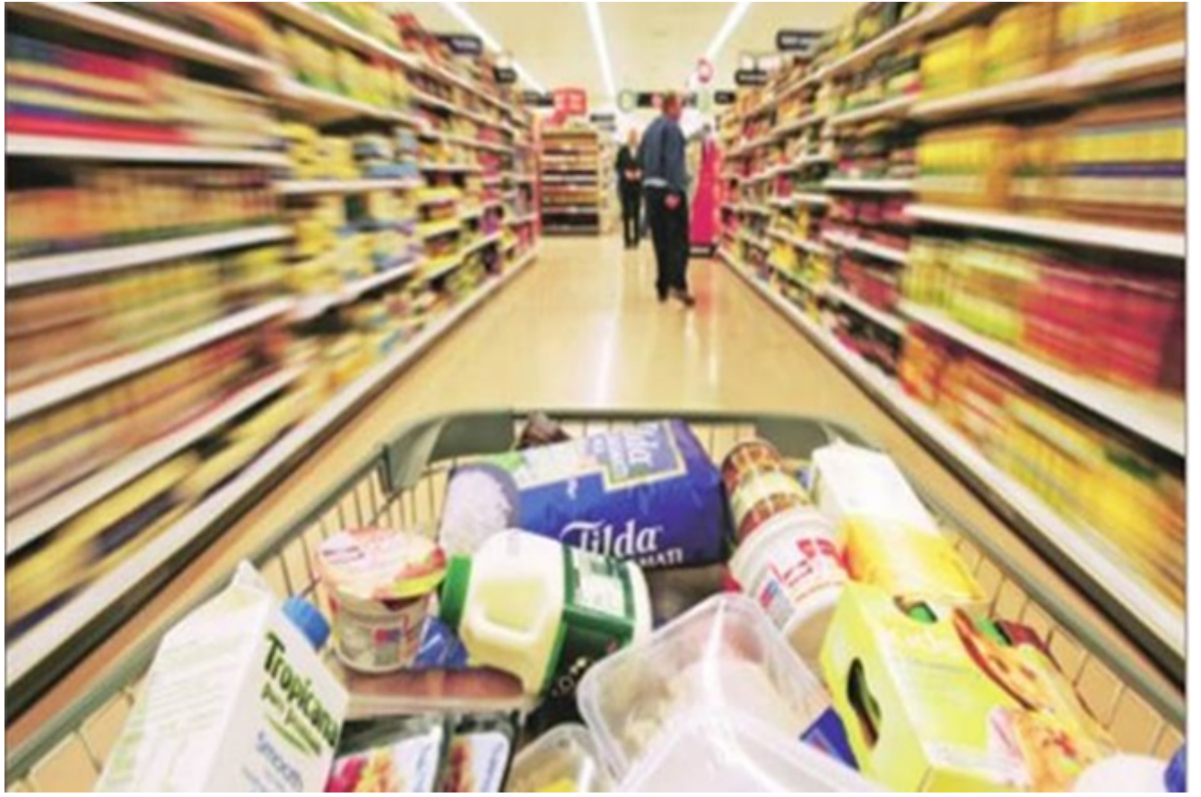
The global direct selling industry has reported an overall decline of 4.3 per cent in sales to USD